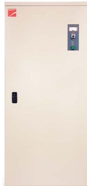
► RE unit